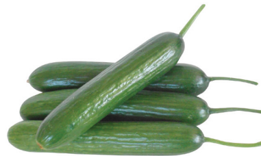
MINI CUCUMBER "KNOSSOU"