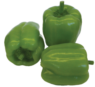
GREEN BLOCKY PEPPER "DOLMA"