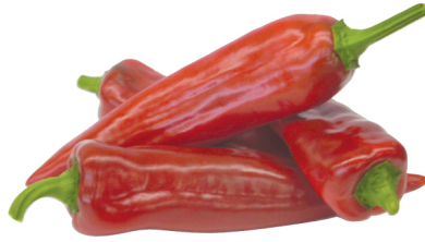
CAPPIA PEPPER "FLORINIS"