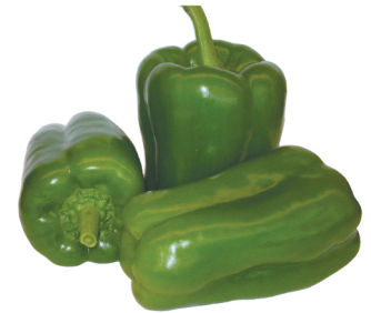
GREEN PEPPER "FLASKA"